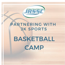
Basketball Camp Starts Monday!