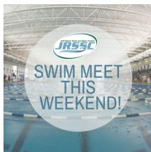
Swim Meet June 16-18