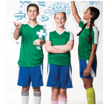
Summer Youth Sports and Camps