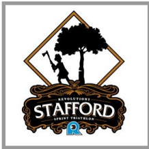
Sprint Triathlon - Price Increase June 1st