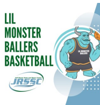
Lil Monster Ballers