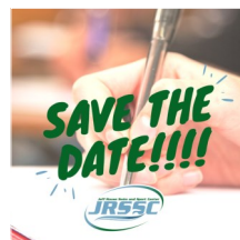
Save the Date